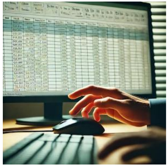
Step 3 - Peel off and stick on the product.